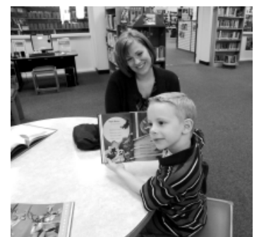
Hopewell-Loudon Kindergarten students toured the Tiffin-Seneca Public Library during a recent field trip.